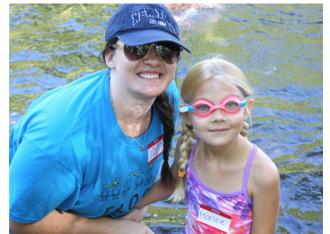
Flock Fieldtrip to Bidwell Park

Several participants even exchanged phone numbers and personal information so that they could set up future play dates and hang outs. Little Red Hen would like to send out a HUGE thank you to MONCA for letting the FLOCK participants use their facilities; we encourage you to check out the museum for yourself and see what all the hype is about!