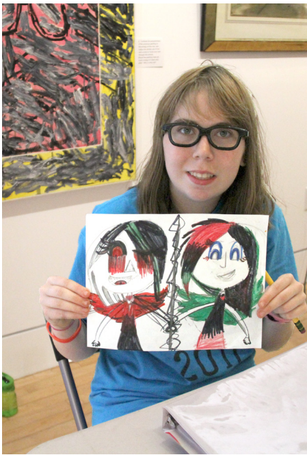
Art assignment at Flock Level II