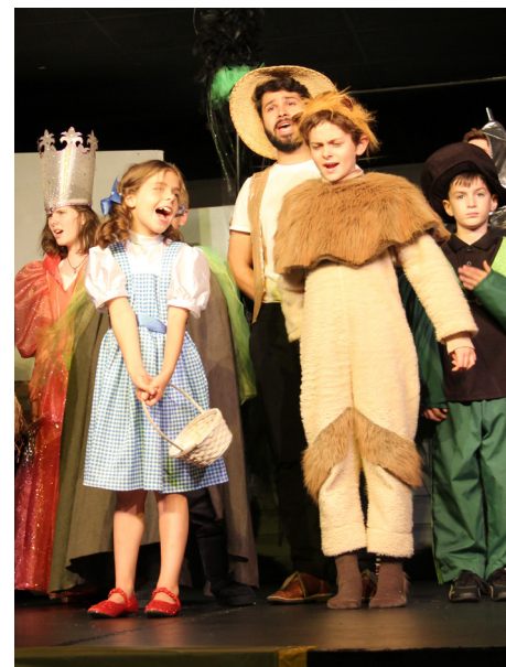
Children singing in the final production