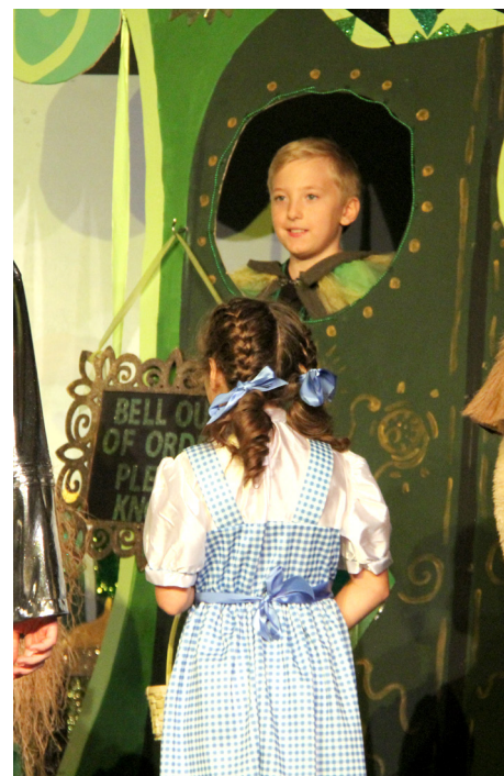
“No one can get in to see the wizard!”

Costumes needed sewing, sets needed constructing, and countless lines needed memorizing. Everyone from the Little Red Hen staff to the amazing kiddos in the program worked countless hours to produce something truly amazing on stage. The night of the performance the kids were absolutely