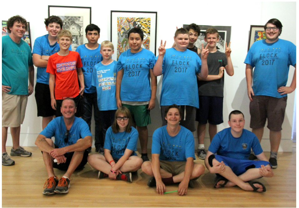
Flock Level II at MONCA

Level One was able to visit the Gateway science museum, visit local playgrounds and participants were also able to go on several community lunch outings.