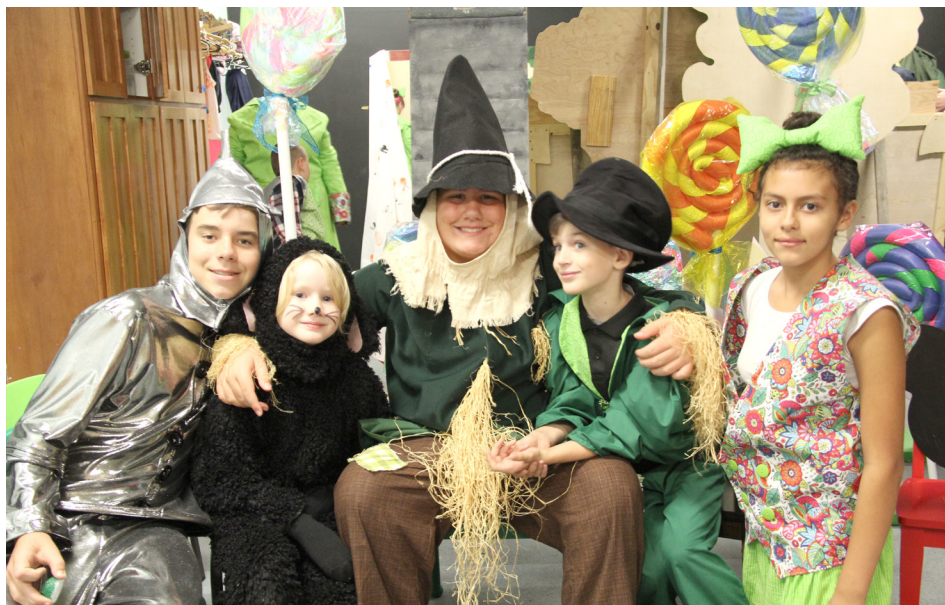
Participants in the Wizard of Oz production had fun making friends