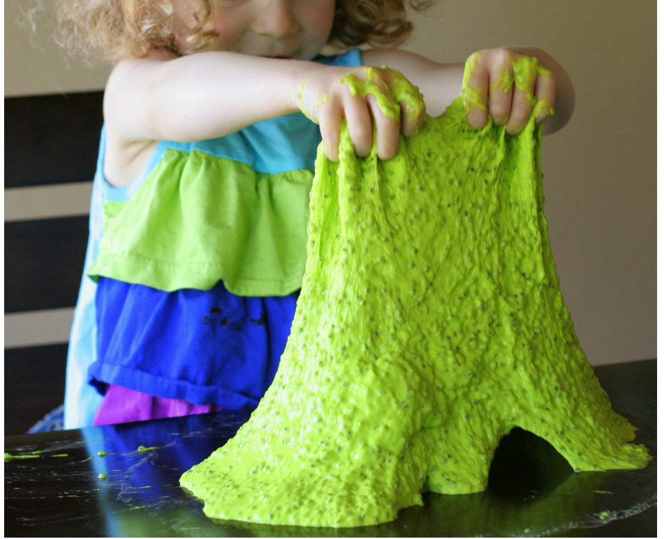
Edible slime with green food coloring

Have some fun with your kiddo and follow the instructions below!